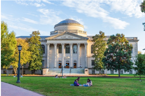
University of North Carolina

The Purpose of the Hagan International Scholarship is to provide recipients with the opportunity to attend graduate school at a U.S college or university. And, to learn important life skills not typically covered in the school curriculum.