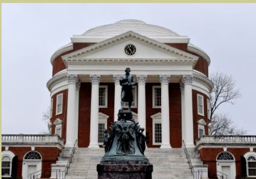
University of Virginia

“ You can’t go back and change the beginning, but you can start where you are and change the ending.” C.S. Lewis