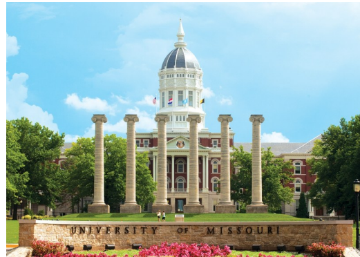
University of Missouri-Columbia