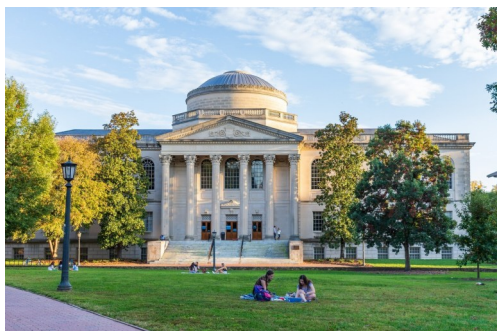
University of North Carolina

The Purpose of the Hagan International Scholarship is to provide recipients with the opportunity to attend graduate school at a U.S college or university. And, to provide recipients with a practical understanding of important life skills not typically covered in the school curriculum.