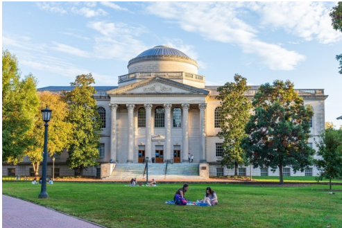
University of North Carolina

The Purpose of the Hagan International Scholarship is to provide recipients with the opportunity to attend graduate school at a U.S college or university. And, to provide recipients with a practical understanding of important life skills not typically covered in the school curriculum.