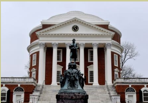
University of Virginia

“ You can’t go back and change the beginning, but you can start where you are and change the ending.” C.S. Lewis