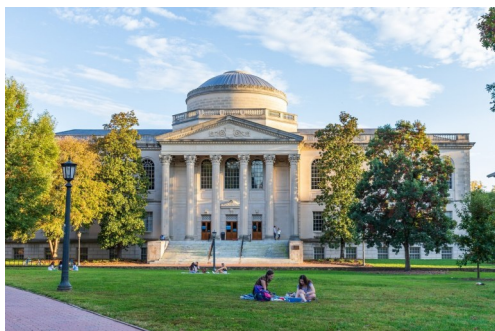
University of North Carolina

The Purpose of the Hagan International Scholarship is to provide recipients with the opportunity to attend graduate school at a U.S college or university. And, to provide recipients with a practical understanding of important life skills not typically covered in the school curriculum.