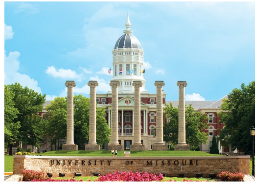
University of Missouri-Columbia